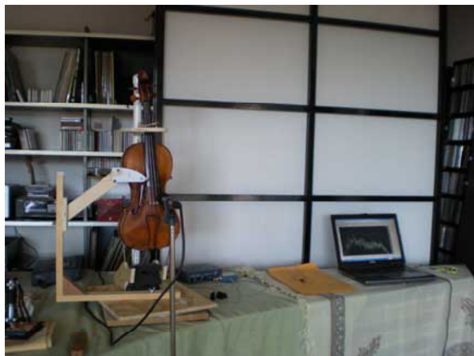
Pictured is some of my equipment that I set up on top of a harpsichord. The Guarneri is being held in a device while the sound is analyzed with spectrum analysis software on the laptop to the right. This allows me to study the sound characteristics at various distances from the violin as well as a full 360-degree rotation.

I was able to acquire not only the standard information, i.e. mechanical measurements, extensive photographs, tracings, etc. but also was able to do a full modal analysis of the instrument to study its vibrational characteristics, a complete analysis of the sound radiation from the violin, allowing me to link the one set of data with the other as well as latex castings and a complete CT scan.