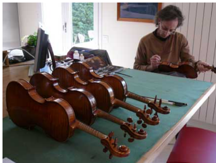
3 of the violins were old; 2 Stradivarius, 1 Guarneri and one of mine. In this photo I was doing varnish touchup but most of my time this particular day was spent doing tonal adjustments on the antique instruments.