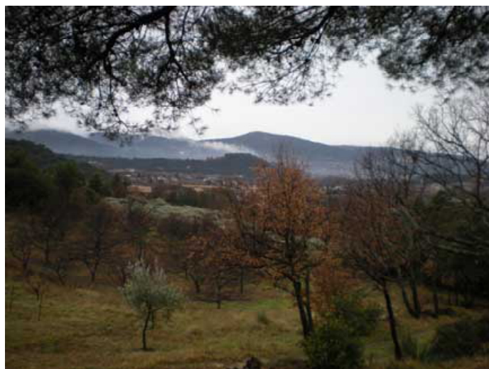
Although for the entire 5 days I studied the Guarneri I rarely left its company I did have a magnificent view of the French countryside from my workspace.

At this point, this instrument is quite possibly the most comprehensively studied instrument in the world as each of these individual pieces has been done on other instruments, (but to my knowledge never all of these components for one instrument) affording a wonderful opportunity to more fully understand what makes the great instruments great.